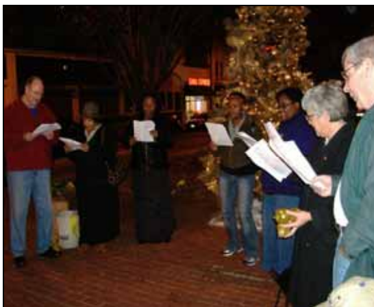
Carolers at Waverly Wonderland Tree Lighting