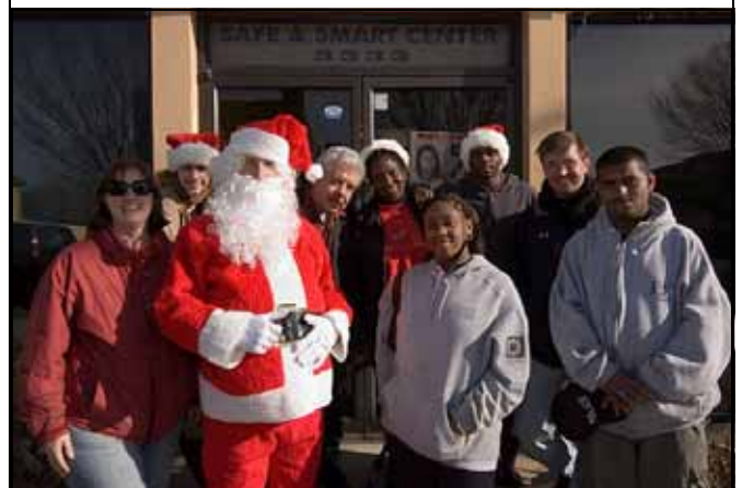
Santa with Workshop volunteers